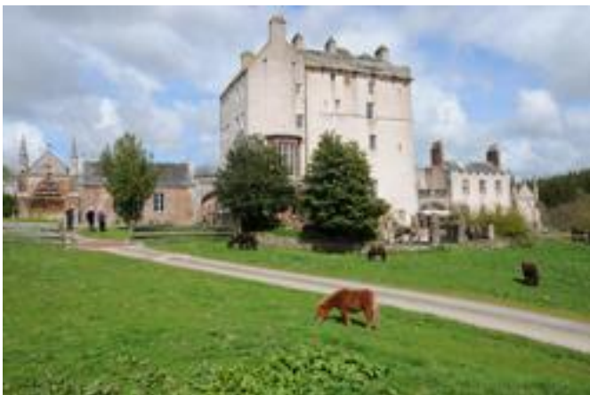
Delgatie Castle near Turriff, Clan Hay Centre