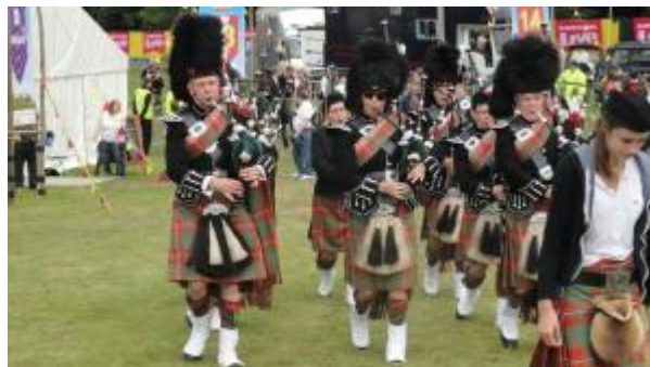
Clan Hay Pipe Band at Bannockburn