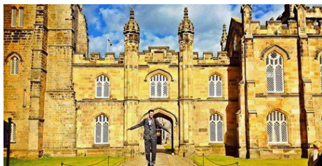
"Here comes the sunshine", revealing the golden sandstone of Moray

Workmen building the chapel used golden sandstone brought in from Moray and uniquely as well, the woodwork is of the best medieval carvings across Scotland. The crown at the top of the chapel tower, is unmistakably, an imperial crown. Those who visit the chapel describe the chapel as of the most peaceful and meditative that they have visited. Worship services are still held every Wednesday evening.