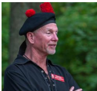
From the desk of the President