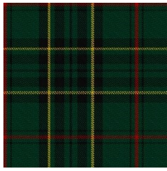
MacArthur-Fox Green MacArthur-Fox Dress MacArthur-Fox Blue MacArthur-Fox Hunting